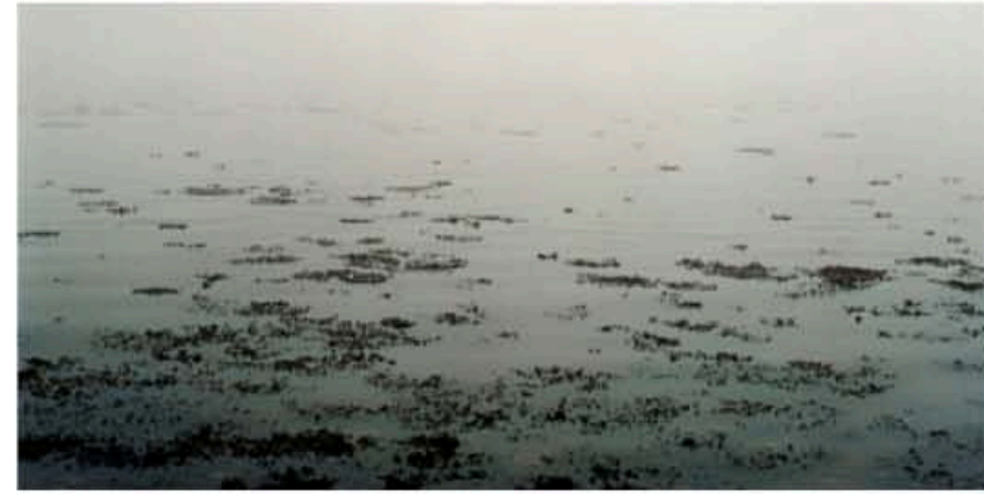
Fogged by Sara Lubich

This work is part of a larger series called 'Floating Underneath', which deals with existentialism in a poetic form. The works in the series illustrate moments of states associated with the sometimes difficult and challenging task to navigate through life.